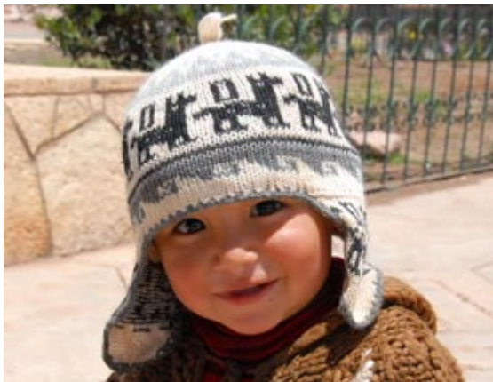
Little Girl Enjoying Mountain Sun in Sacred Valley Town of Maras

Peru has taught us many things. It was not an easy trip, but we will have many fond memories of Peru for many years to come.