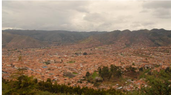
City of Cusco

From Cusco to Machu Picchu is 70 miles, and in that general area are five mountain ranges with year-round glaciers. Peaks in two places rise over 20,000 feet. In the rainy season deep snow collects on these mountains adding to the beautiful of the unique area.