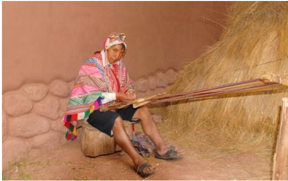
Man Weaving Cloth from Llama or Alpaca Wool

The people of the Andes have been domesticating llamas for over 5,000 years, using them for clothing, meat, shelter, fertilizer, and beasts of burden. The Spanish brought donkeys with them in the 1,500s and now they are very common. Apparently the donkeys have replaced the llamas and alpacas as beasts of burden. We actually saw very few llamas and alpacas anywhere in Peru.