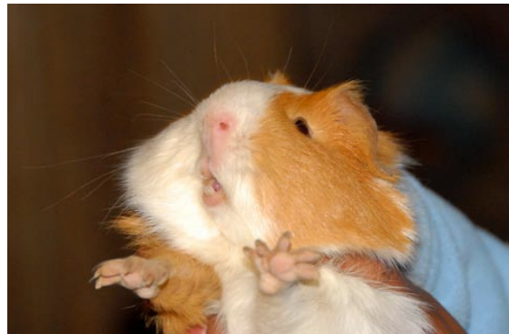
Guinea Pig Asking Not to be Eaten -- (They are a favorite food in Peru)